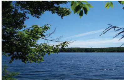
The Headwaters of the Poestenkill

You could also help out in our fundraising campaigns.