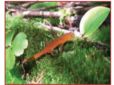
A great habitat for amphibians

meets for specialized in-depth events and workshops throughout the year and